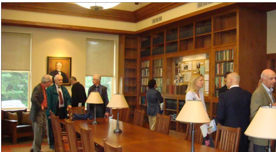
The Szybalski Room houses the library's collection of publications pertaining to the history of the laboratory since its inception; volumes of famed CSH Symposia, and a complete set of publications by CSHL authors.

May 19, 2010 —The Cold Spring Harbor Laboratory celebrated and revealed its newly expanded and renovated Carnegie Building, which houses the Library & Archives. The most significant change to the building is the addition of the Szybalski Annex, which includes the Szybalski Room (pictured below)—a reading area and the new Archives Room.